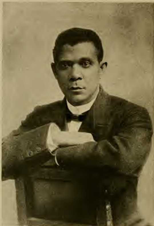
Booker T. Washington.